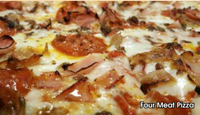
Four Meat Pizza